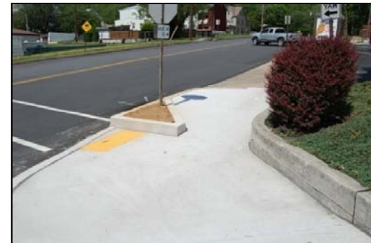
Ramp Design Review Issue