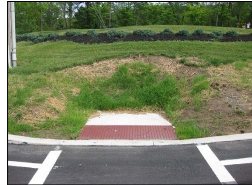
ADA Committee Discussion