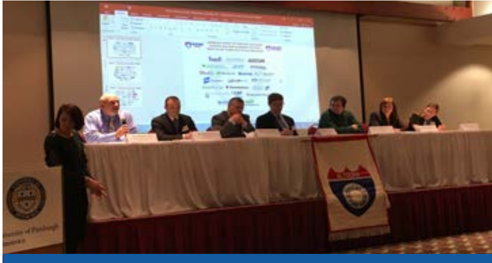
Top, Left, Bottom L and R: Transportation industry panelists