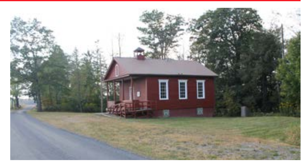
Hint: What is this structure, which is located southeast of Shanksville? (The answer will be published in the next edition of the Inter-Section .)

Where do you think Penny and Dottie are visiting in the beautiful countryside of District 9-0?