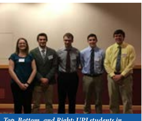
Top, Bottom, and Right: UPJ students in attendance and presented their projects