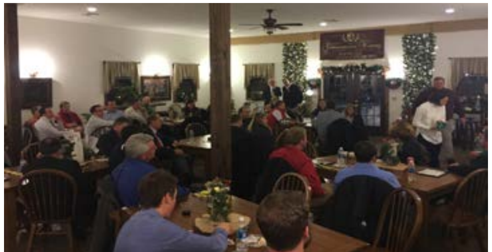
Top: Enjoying dinner and waiting patiently for the lucky raffle numbers to be drawn