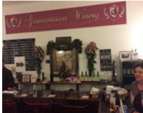
Top and Bottom: Scenes from the winery Right: The festively-decorated raffle table

For more information on the Tiger Pack Program, visit the Tiger Pack Program Facebook page.