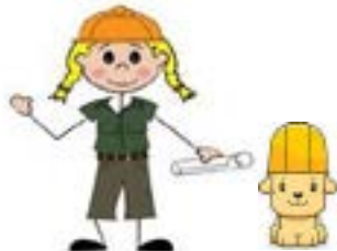
Penny & Dottie

Where in District 9-0 are Penny and Dottie?